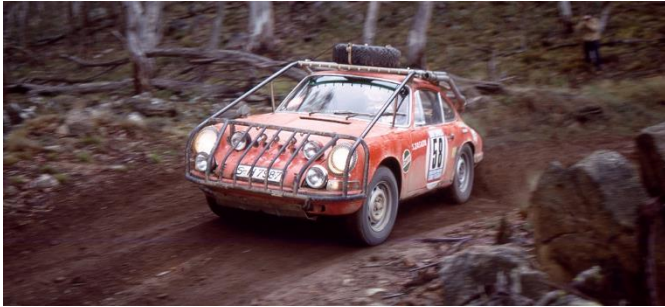
#58 – the Sobieslaw Zasada Porsche 911 S which finished 4 th

OK, we can't drive from London to Sydney in 2021 but we can do the next best thing – retrace the steps of the game-changing, gruelling Perth to Sydney Australian leg. Original vehicles that will be involved in 2021 are featured.