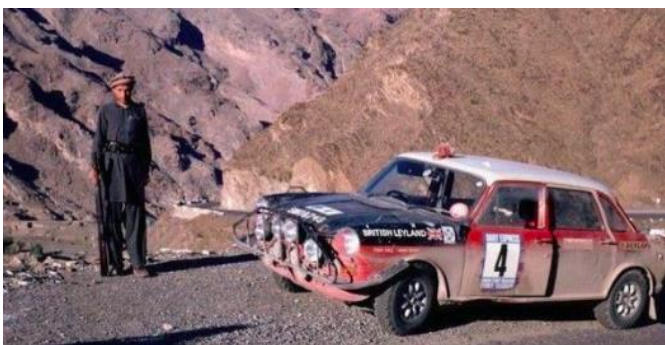
#4 BMC Austin 1800 driven by Tony Fall to 24 th

The 2021 Perth-Sydney Marathon will celebrate the 1968 London to Sydney Marathon by following the original route of the event across Australia from Perth to Warwick Farm in Sydney. Starting in Perth on the 29 th October 2021 and finishing ten days later with a function at Warwick Farm in Sydney on the 7 th November.