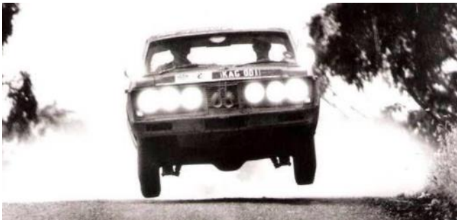
#2 Ford Falcon GT driven by Harry Firth to 8 th

Back in the day, the first car to finish took an eye-watering 67 hours and 22 minutes non-stop – we will not attempt to replicate that feat.