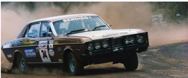
#97 Ford Falcon GT driven by Rex Lunn but retired in Tehran

The Entry Fee for the Event is $AUD5685 for a crew of two in the nominated vehicle and includes all meals but excludes accommodation. An invitation to participate in the Event will require a $AUD250 deposit followed by the payment schedule outlined in the Event Supplementary Regulations . Entries are limited to 85.