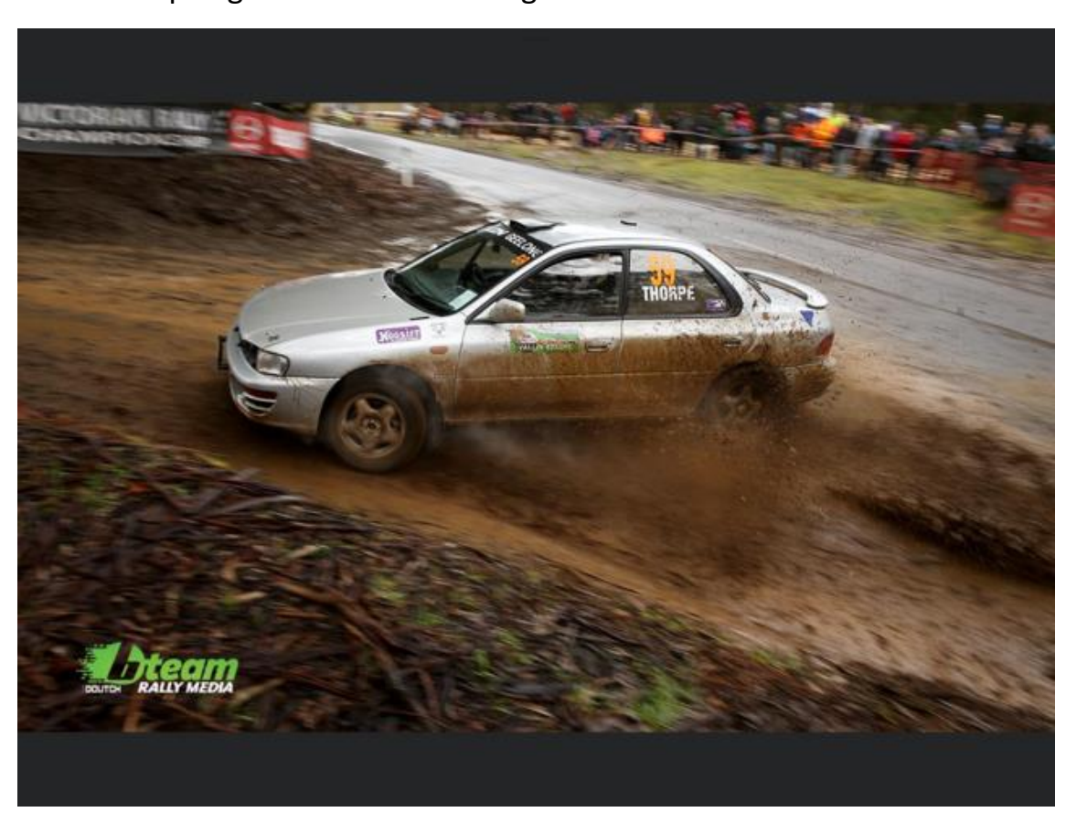
Just keeping it on the road!