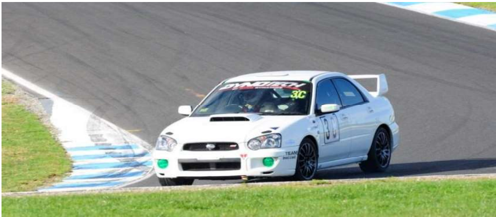
Wilsons a few years back

Saturday will see you practice in heats and set your target lap time. Sunday is the 6 Hour regularity relay event where you try and match your target time. Teams are usually 5 members but can be 4 or up to 6 drivers.